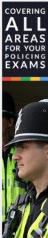
SPECS 120 x 600px