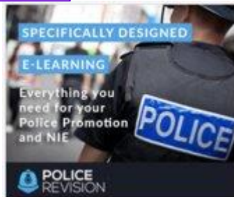
SPECS - 300 x 250PX